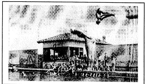
Arizona Daily Star 1938 file photo reproduced with permission. In 1938 there were 4 municipal swimming pools in Tucson. "Northside Pool (now Himmel Pool) boasted the most elaborate water purifying system in the state. Photo # 14-7279 courtesy of the Arizona Historical Society/Tucson.

Today, palm trees line the north side of the enclosed pool area, providing views from within while masking it from outside view. The grassy area north of the main pool and wading pool invites relaxation. To longtime neighborhood resident Frank W. Soltys, "it feels like being in a Maxfield Parrish print." The special feel of the place has drawn young and old for more than 70 years. "You can talk to a lot of the older people in town and a lot of them will tell me, 'I learned to swim at Himmel Pool,'" Sassi said. To share your memories of Himmel Pool, please send an e-mail message to samhughesneighbors@mac.com , write to SHNA, P.O. Box 42931, Tucson, AZ 85733-2931, or attend the free swim event July 31.